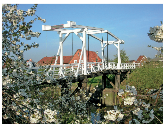
13.00 o'clock Lunch on the Oelkers-Hof

landscape in the west of Hamburg and one of the largest fruit-growing areas in the EU.